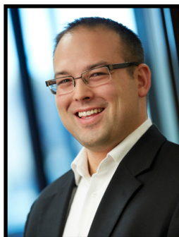
Dan Motoyoshi Signature Bank