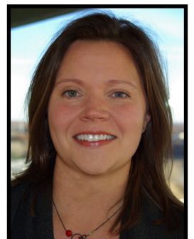
Kim Wittmers Boulay PLLP