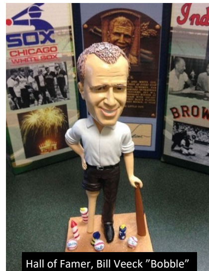
Hall of Famer, Bill Veeck "Bobble"

"If you listen to the customers/fans, you can never go wrong. I make every decision the exact same way my dad did, and my grandfather did. It's all about listening to the people."